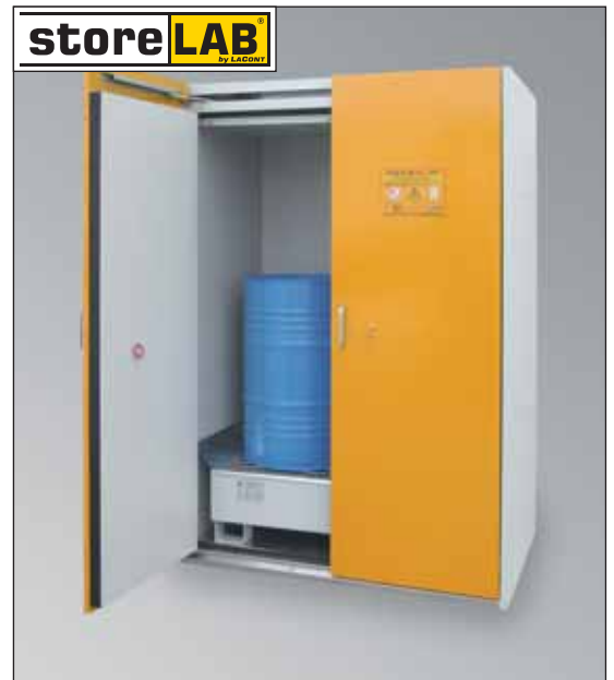
SIS-FAS Type 90 / 1550-CW, Article No. B80-2850-A

i Generous door clearances for easy and convenient euro-pallet handling.