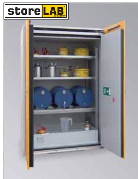
Sis-FAS Type 90 / 1550-360 GR, Article No. B80-2856-A