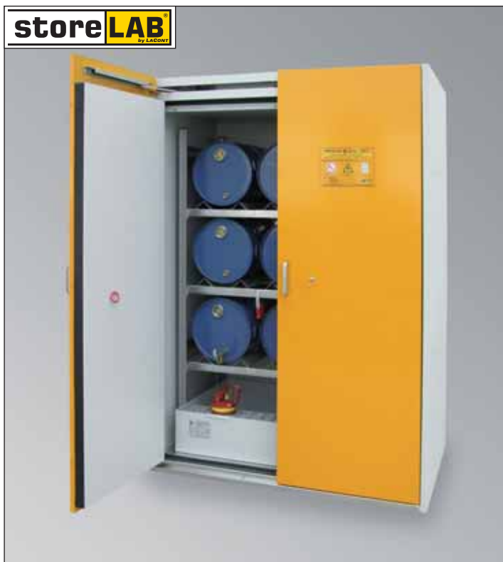
SIS-FAS Type 90 / 1550-960, Article No. B80-2854-A