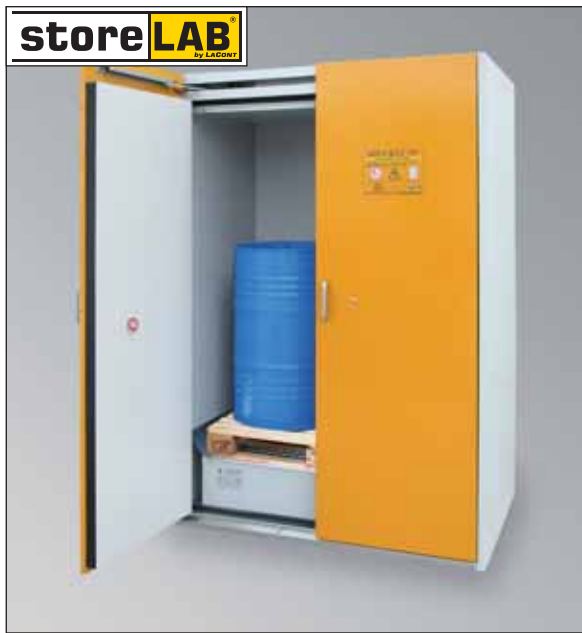
SIS-FAS Type 90 / 1550-EW, Article No. B80-2851-A