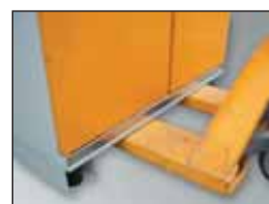
Socle, Art. No. B80-2714-A