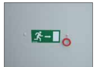
emergency opening device