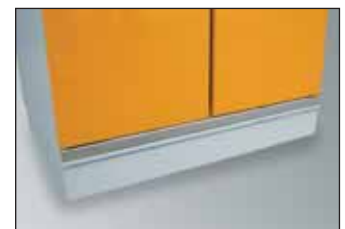
with removable panel