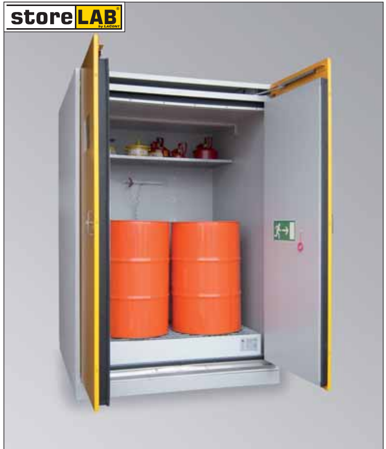
SIS-FAS Type 90 / 1550-1430, Article No. B80-2981-A, with optional grid