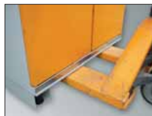
Socle as standard