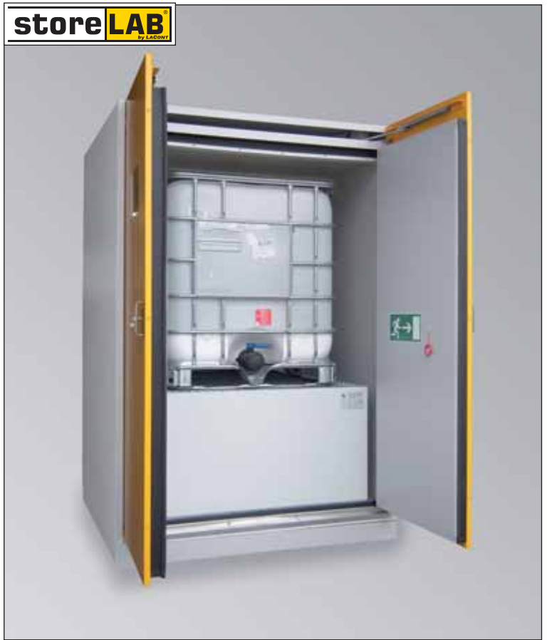
SIS-FAS Type 90 / 1550-1430 K, Article No. B80-2983-A