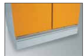
with removable panel