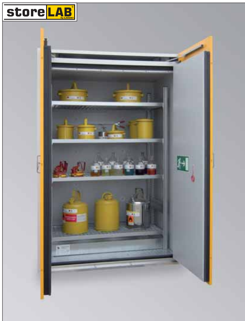
Sis-FAS Type 90 / 1550 KG-GR, Article No. B80-2857-A