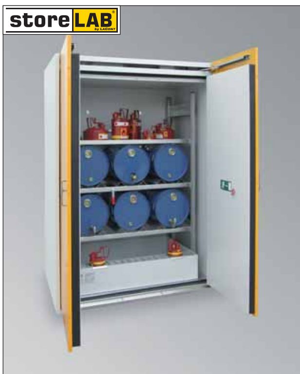
SIS-FAS Type 90 / 1550-660 GR, Article No. B80-2855-A