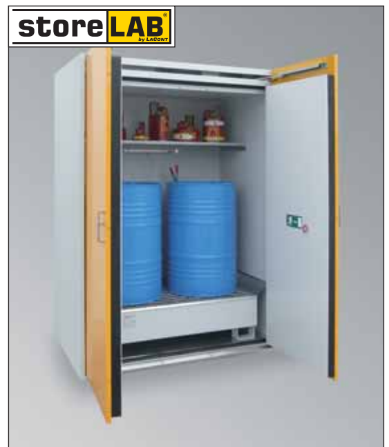
SIS-FAS Type 90 / 1550-CW, Article No. B80-2850-A, with optional grid for storing small containers