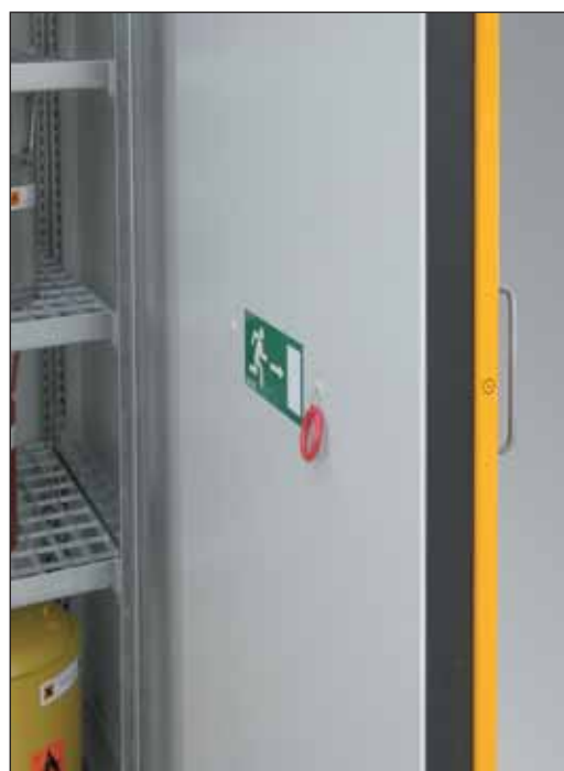
emergency opening device