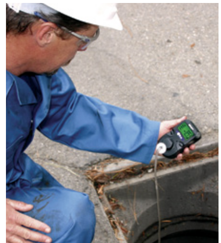
QRAEII Pump being used for a confined space entry

SPE O 2 ™ sensor designed to meet RoHS directive