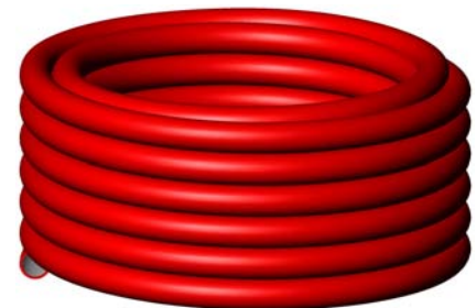
POKAPOSTE SEMI-RIGID HOSE