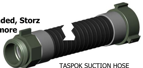
TASPOK SUCTION HOSE