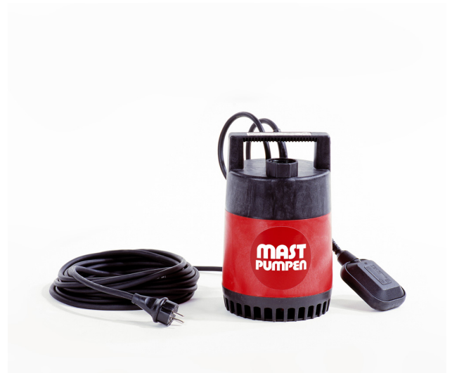
Förderhöhe H m (WS)

Wastewater · 1~ 230 V 50 Hz with float switch