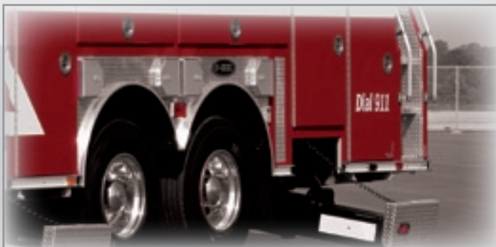
Valuable storage space is provided by the under-slung outriggers which allow compartments to be placed over each of the outriggers.