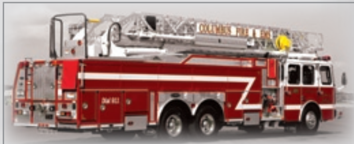
Innovative body design permits hose repacking without moving the ladder. Multiple right-side body compartment options are available to increase hosebed and compartment space.