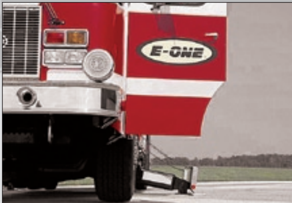
If You Can Open the Doors, You Can Set The Narrow 12' Outriggers