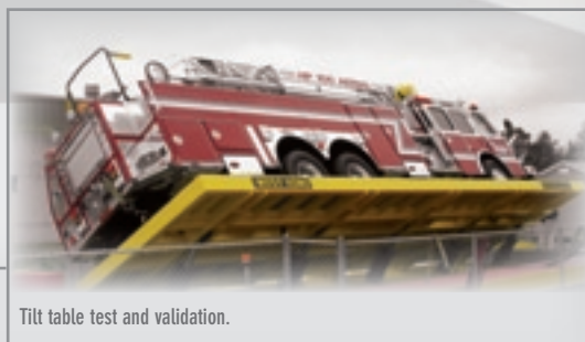
Tilt table test and validation.