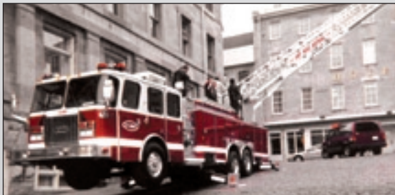
Excellent Stability Allows Easy Set Up On Hilly Terrains