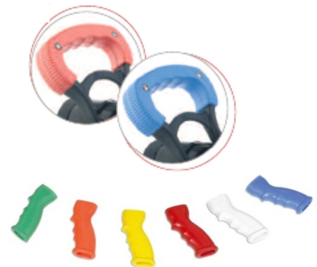
Grips available in several colours