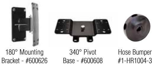
180° Mounting Bracket - #600626