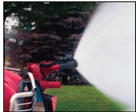
Adjustable Flows Available See page 33 for nozzle specs