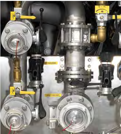
Adjustment of the proportioning rate stepless directly on the outlets