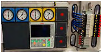
Operation of the water pump, light mast and HYDROMATIC via LCS (Logic Control System) display