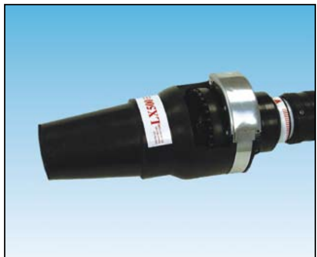
LX500 Low Expansion Foam Attachment