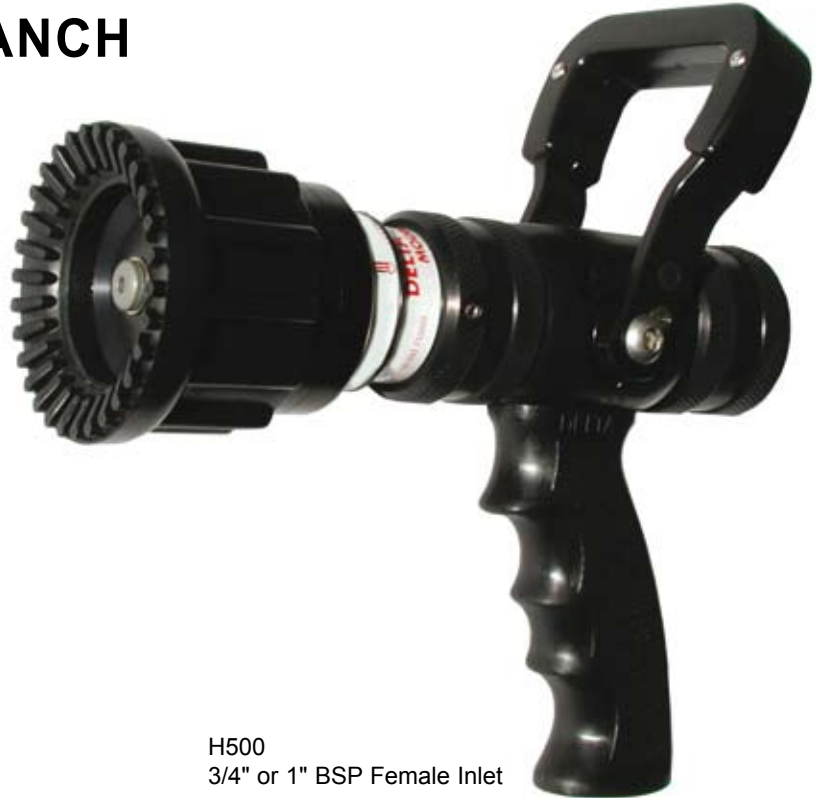
H500 3/4" or 1" BSP Female Inlet

Made in UK Under ISO 9001 Quality System