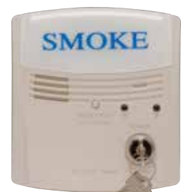
RTS2-AOS UL S2522