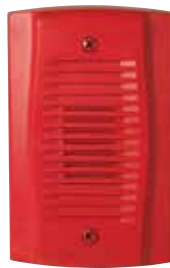
MHR UL S4011