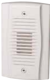
MHW UL S4011