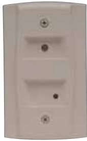
RTS151 UL S4011

System Sensor provides system flexibility with a variety of accessories, including two remote test stations and several different means of visible and audible system annunciation. As with our duct smoke detectors, all duct smoke detector accessories are UL listed.