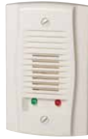
APA151 UL S4011