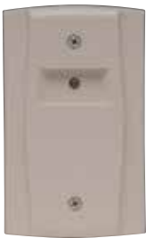
RA100Z UL S2522