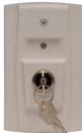
RTS151KEY UL S2522