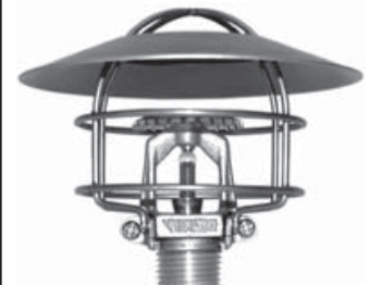
Upright Intermediate Level Sprinkler (with Guard and Water Shield)

Order Water Shield Separately. (Field Assembly Required.) See Installation Instructions.) Order Sprinkler Guard Separately or Factory Installed. (See Ordering Instructions.)