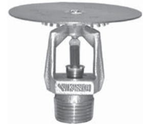
Upright Intermediate Level Sprinkler (Factory pre-assembled only)

Viking Technical Data may be found on The Viking Corporation's Web site at http://www.vikinggroupinc.com . The Web site may include a more recent edition of this Technical Data Page.