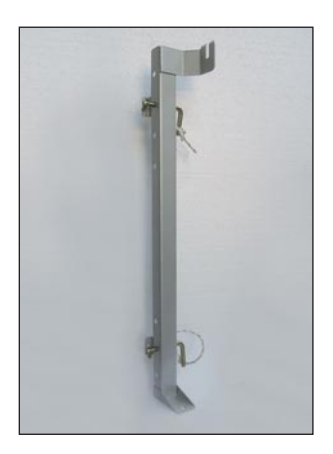
Vehicle Mounting Bracket Set