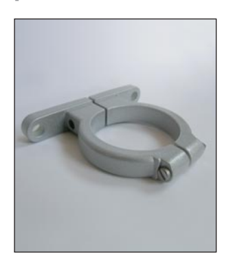
Wall Mounting Bracket