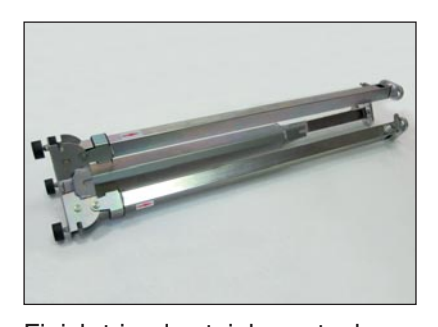
Finish tripod : stainless steel

This very stable stand folds vertically and is easy to carry and store. All Mk VI Tripods can either be stored vertically or horizontally.