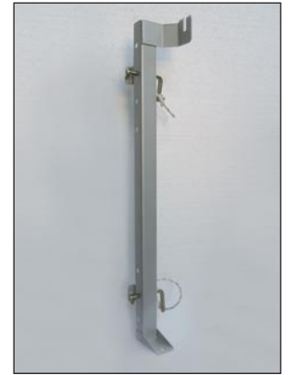
Vehicle Mounting Bracket Set Cat. No. 11446/SG