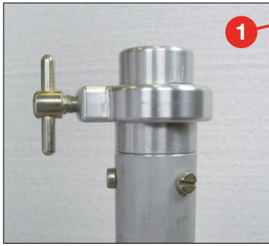
24 mm diameter quick clamp socket