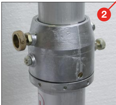
Lockable rotating collar