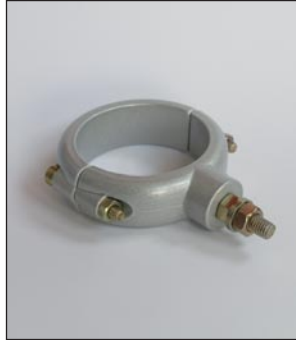
Mounting Ring Cat. No. 2148/SG