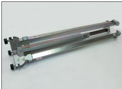
Finish tripod : stainless steel

This very stable stand folds vertically and is easy to carry and store. All Mk VI Tripods can either be stored vertically or horizontally.