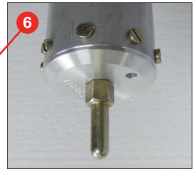
Bottom pin for quick and easy fitting onto a tripod or vehicle mounting bracket