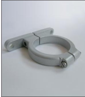
Wall Mounting Bracket Cat. No. 1984/SG