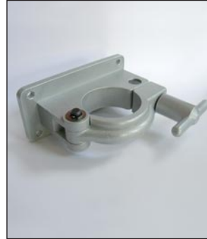
Saddle Clamp Cat. No. 25960/SG