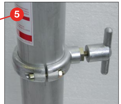
Clamp handle for quick and easy fitting onto a tripod or vehicle mounting bracket