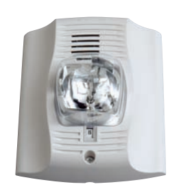
CHSW White Chime Strobe