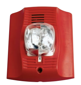
CHSR Red Chime Strobe