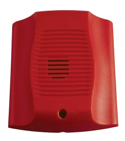
CHR Red Chime