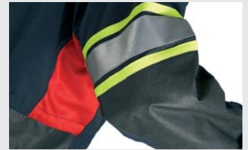
Wear-proof reinforcements at elbows and sides