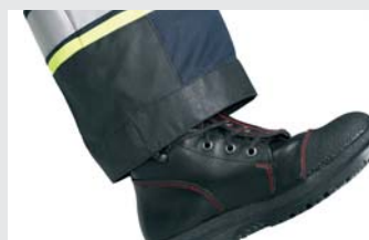
Additional reinforcement at the knees, on the side and on the end of the trousers