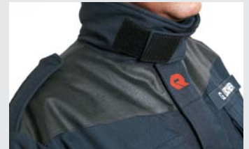
Additional reinforcement at the shoulders