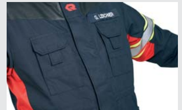
Two breast pockets for radio