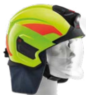
157385 + 157349