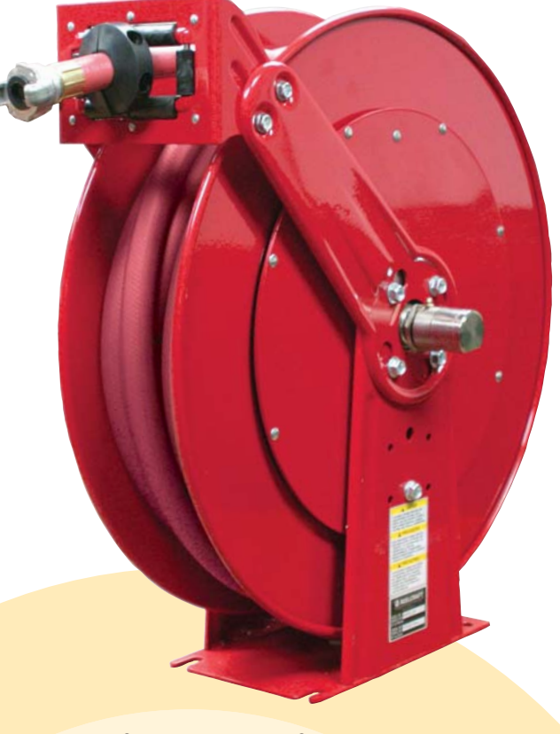
Model Shown: PAVD83075 OLP