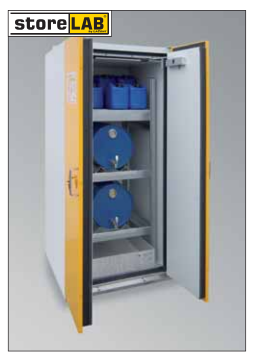
SiS-FAS Type 90 / 900-260 GR, Art. No. B80-2876-A

SiS-FAS Type 90 / 900-360, Article No. B80-2875-A