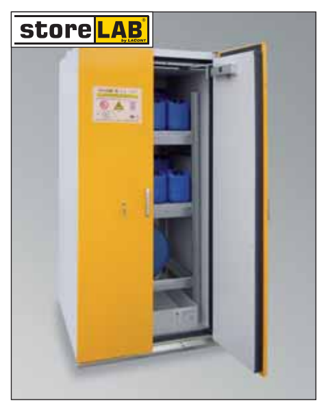
SiS-FAS Type 90 / 900-160 GR, Art. No. B80-2877-A