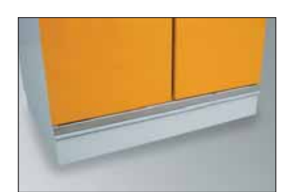
with removable panel