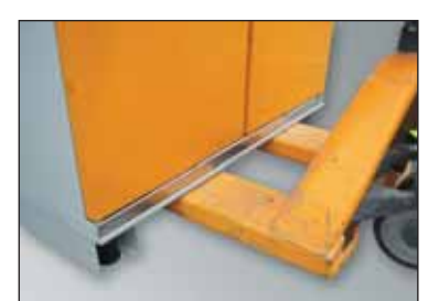
Socle, Art. No. B80-2713-A

Suitable for installation directly at workplace !