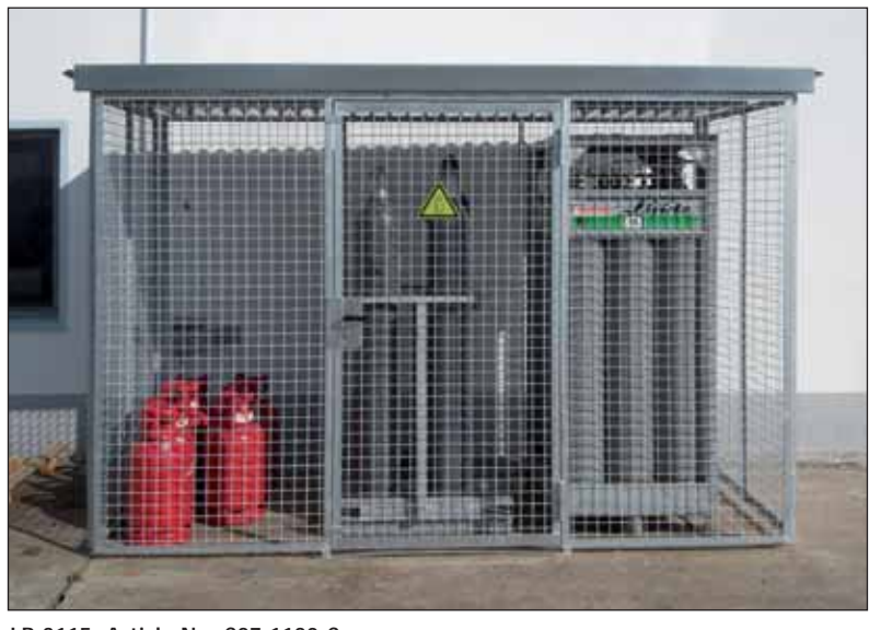
LB-3115, Article No. C27-1120-C