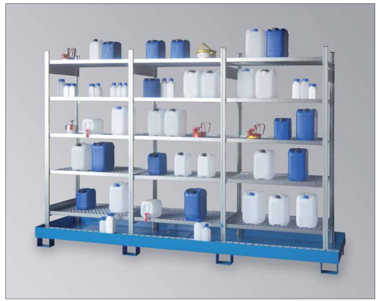
GR3-G, sump pallet painted, Article No. R71-2091-C

Hazardous substances shelvings are available in several versions: