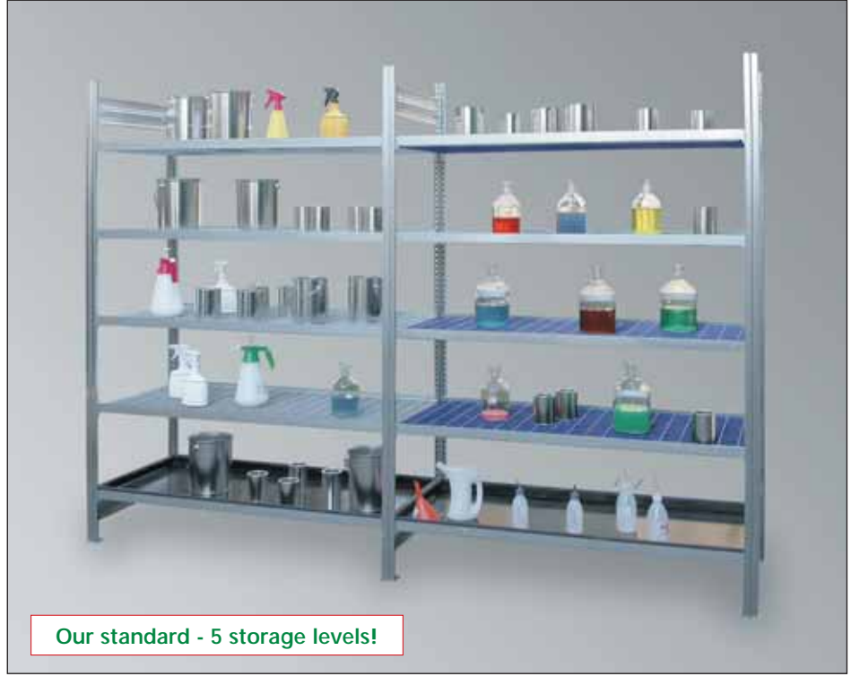
KG-GR 130 GPE, basic unit, Art. No. R71-2132-D and KG-GR 130 PG, extension unit, Art. No. R71-2143-D