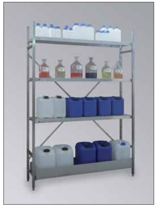
KG-GR 1200-300 VA, basic unit, Art. No. R71-3014-A