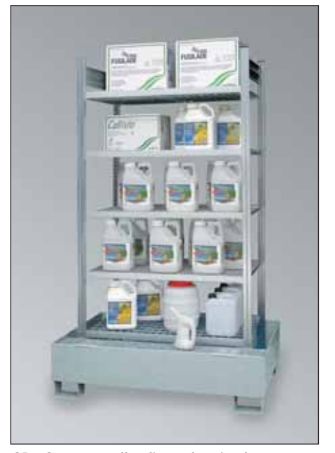
GR1-G, sump pallet <u>fire-galvanized</u>, Art. No. R71-1061-C