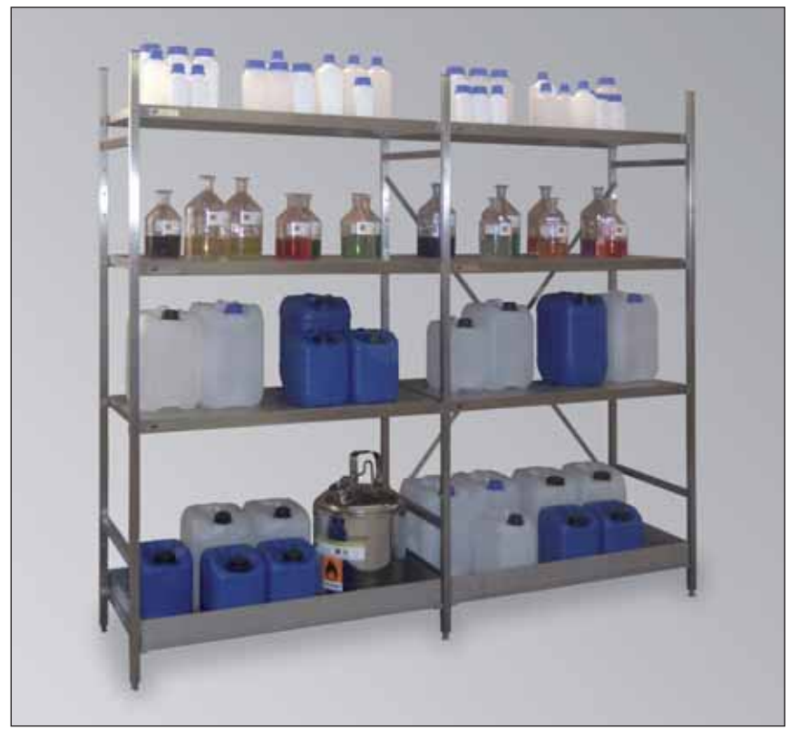
KG-GR 1200-500 VA, basic unit, Art. No. R71-3024-A and KG-GR 1000-500 VA, extension unit, Art. No. R71-3023-A