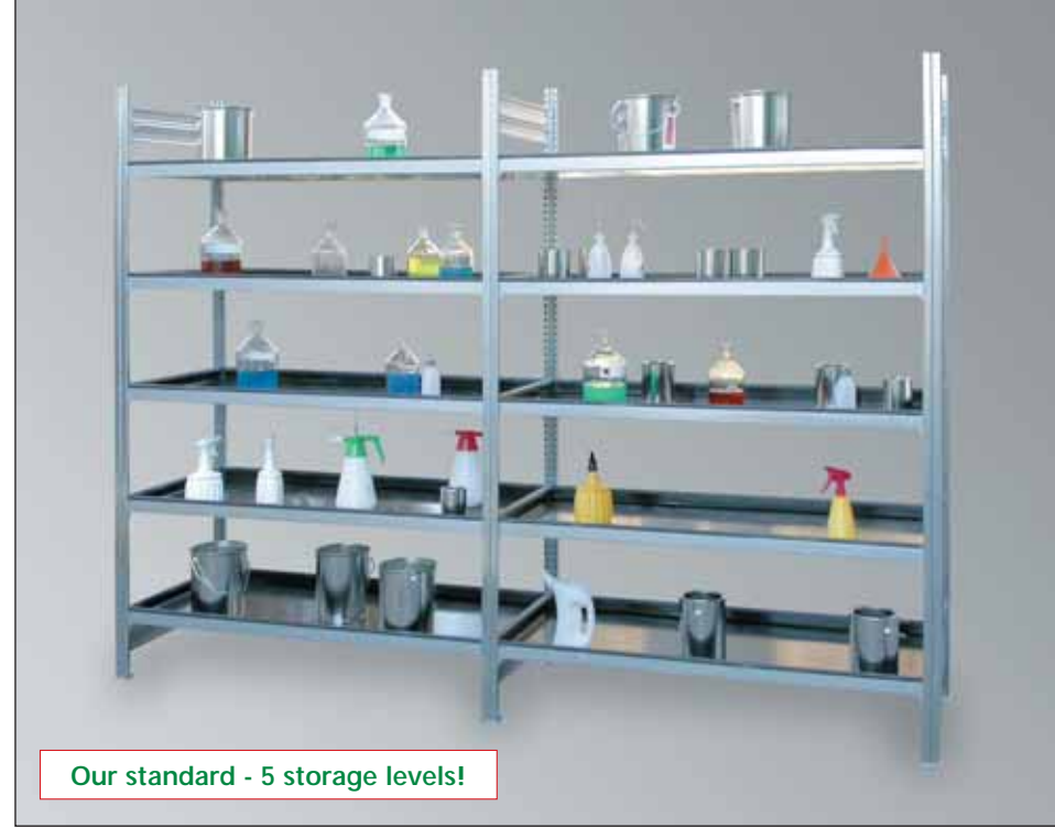
KG-GR 130 WPE, basic unit, Art. No. R71-2122-D and extension unit, Art. No. R71-2123-D