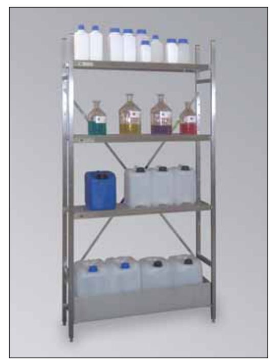
KG-GR 900-300 VA, basic unit, Art. No. R71-3012-A