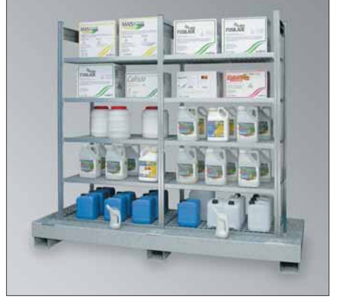
GR2-G, sump pallet fire-galvanized, Art. No. R71-1081-C