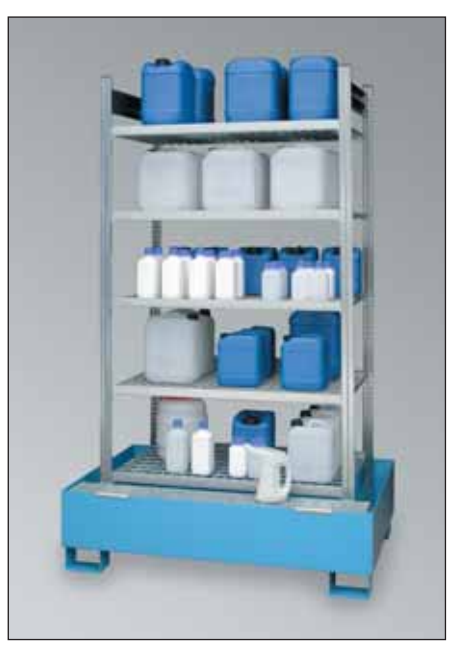
GR1-G, sump pallet painted, Art. No. R71-2061-C