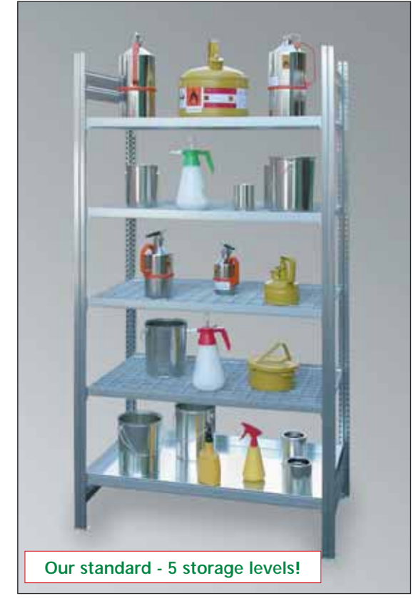
KG-GR 100 G, Article No. R71-2110-D