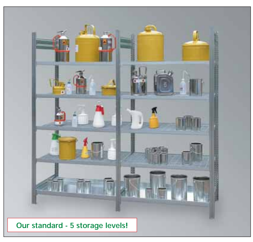
KG-GR 100 G, basic unit, Art. No. R71-2110-D and extension unit, Art. No. R71-2111-D \,