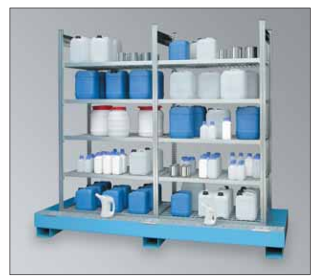
GR2-G, sump pallet painted, Art. No. R71-2081-C