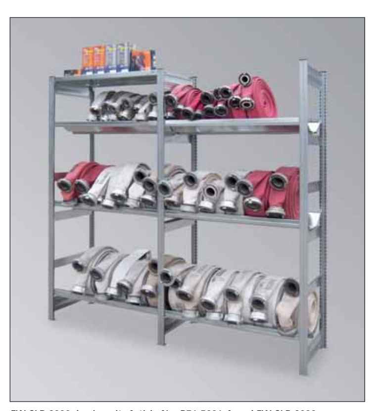
FW-SLR 2000, basic unit, Article No. R71-5001-A and FW-SLR 2000, extension unit, Article No. R71-5002-A, with optional top shelf