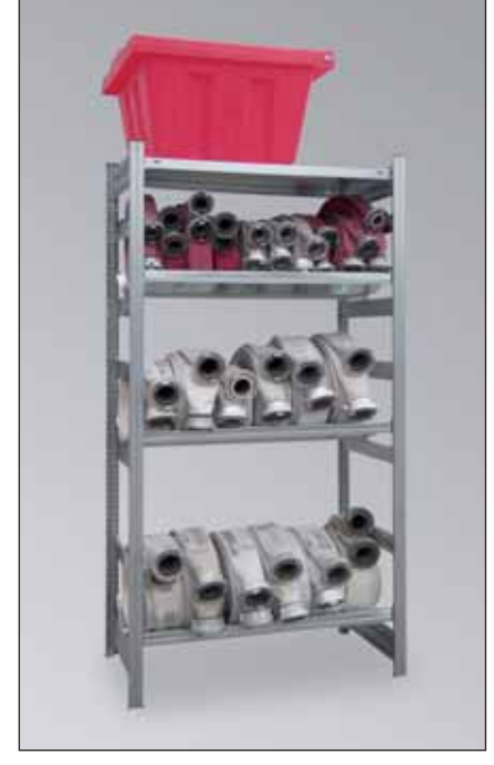
FW-SLR 2200, Article No. R71-5003, with optional top shelf