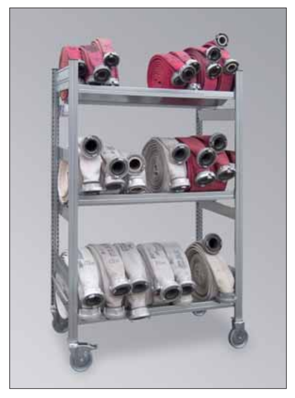
FW-SLW 1600, Article No. R71-5009-A