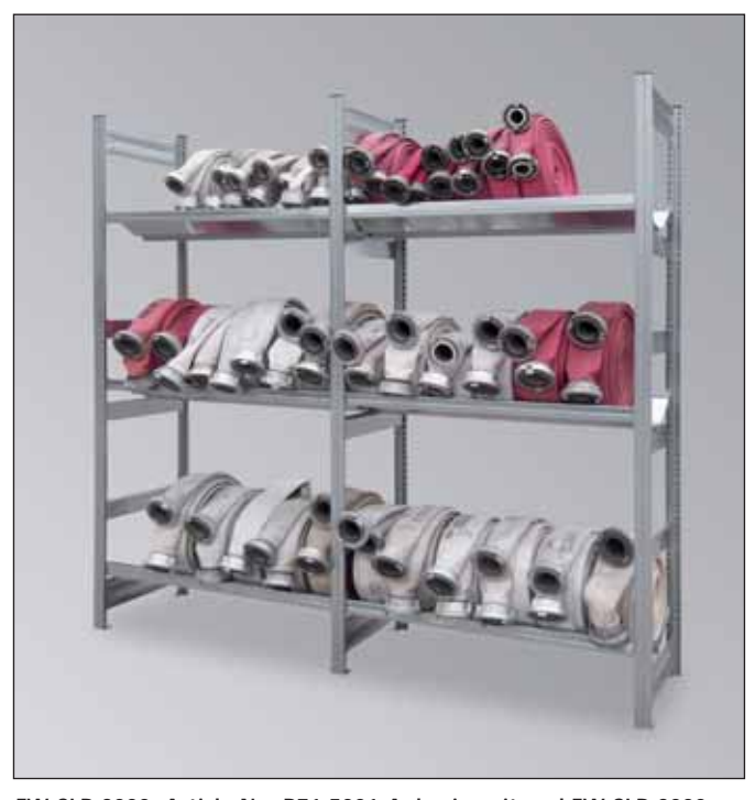
\mbox{FW-SLR 2000, Article No. R71-5001-A, basic unit and FW-SLR 2000, Article No. R71-5002-A, extension unit } \\