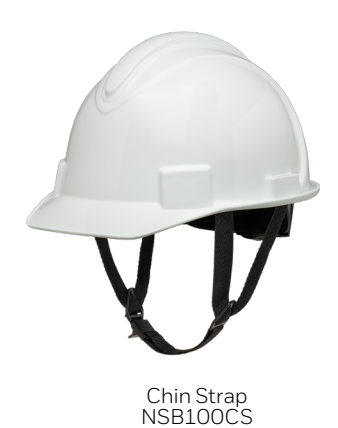
HONEYWELL NORTH SHORT BRIM HARD HAT VENTED