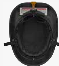
Optional one-piece leather brow comfort cap and ratchet cover

Models HT-BF2-PROX and HT-LF2 PROX available. Both models have STEDAIR® 3000 moisture barrier.