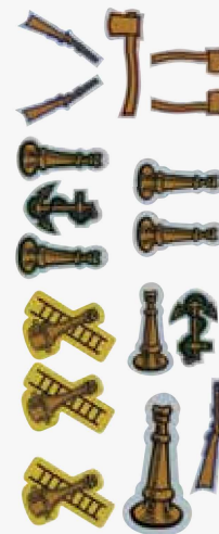
FDNY heraldic reflective insignias