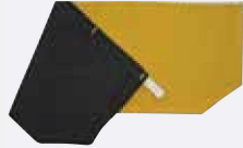
Standard BPR yellow Nomex moisture barrier FR cotton ear cover

(required component) Standard HDO yellow Nomex FR cotton. Optional black PBI® FR cotton (FDNY spec optional material choice). Other outer shell colors available.