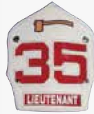
FDNY Assigned Officer