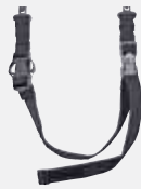
Standard Nomex postman slide and quick-release chinstrap