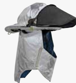
Optional faceshield cover