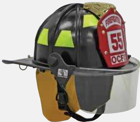
Standard Ben 2 LR PLUS HT-BF2-HDO with yellow Nomex FR cotton ear cover