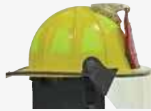
8 trapezoids 3M Scotchlite lime or orange