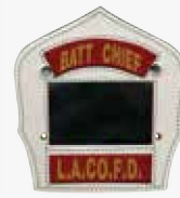
LA County Passport System