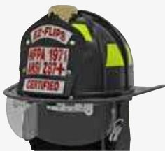
EZ-Flips meets standards of NFPA 1971 and ANSI Z87.1+