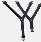
Optional Nomex 4-point with quick-release chinstrap