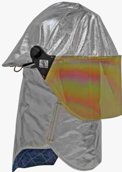
Standard Lite Force Low Rider PLUS HT-LF2-PROX