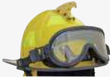
Paulson or ESS NFPA 1971 goggles