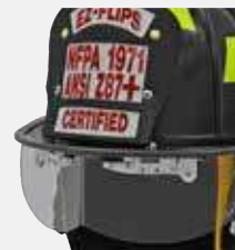
Optional EZ-Flips meets standards of NFPA 1971 and ANSI Z87.1+