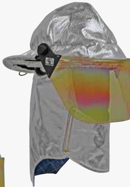
Standard Ben 2 Low Rider PLUS HT-BF2-PROX