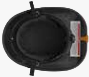
One-piece brow comfort cap and ratchet cover