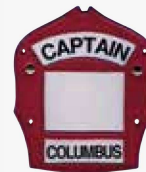
Columbus or Chicago

We can design a leather front to meet your specific needs.