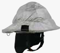
Aluminized PBI cover – recommended for live fire training, not for proximity firefighting