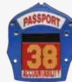
Houston Passport System