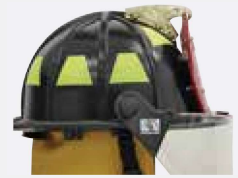
Standard 8 trapezoids Reflexite lime