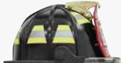
8 trapezoids 3M Scotchlite 2-tone lime or orange