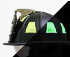
Optional 8 trapezoids Foxfire illuminating