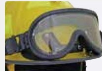
Optional Paulson or ESS NFA 1971 goggles