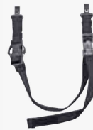
Standard Nomex postman slide and quick- release chinstrap