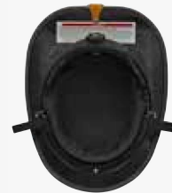
One-piece brow comfort cap and ratchet cover