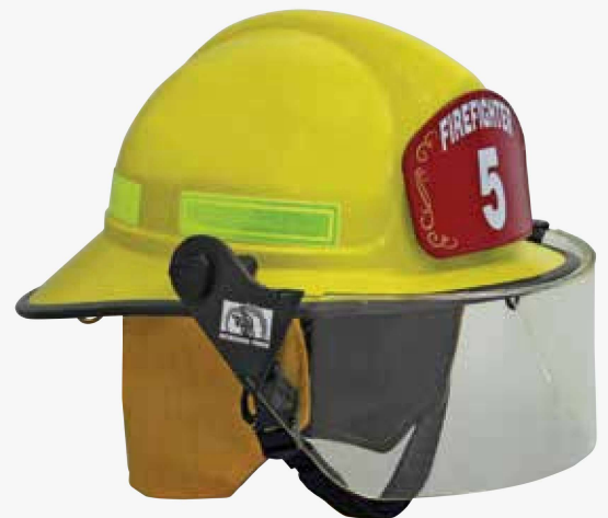
Standard Lite Force LR PLUS HT-LF2-HDO with yellow Nomex FR cotton ear cover

STRUCTURAL MODERN HELMET. NFPA 1971 CERTIFIED.