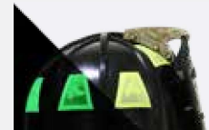
Optional 8 trapezoids Foxfire™ illuminating