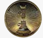
Metal circular rank insignias