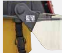
Standard 4" x 0.15" new-generation faceshield