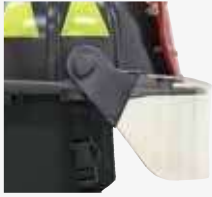
4" x 0.15" new-generation faceshield