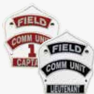
FDNY Field Comm Unit