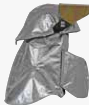
Optional J-Fire shroud