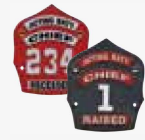
Acting Batt Chief (recessed or raised)