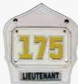
FDNY Covering Officer