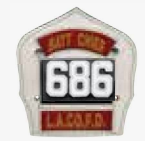
LA County Passport System