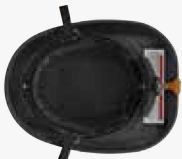
One-piece leather brow comfort cap and ratchet cover