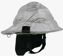
Aluminized Pbi cover – recommended for live fire training – not for proximity firefighting