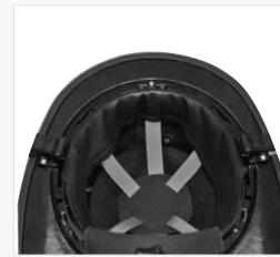
Low Rider leather headband and ratchet cover