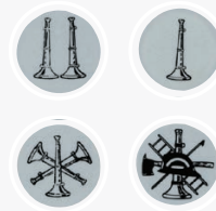
Retroreflective circular rank insignias