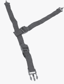
polypropylene 4-point with quick-release chinstrap