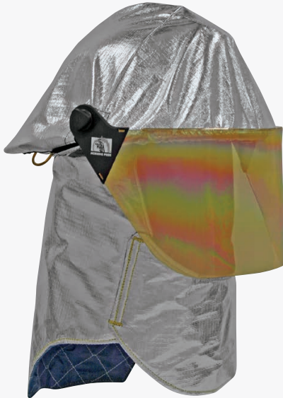
Standard Lite Force LR Low Rider HT-LFL-PROX