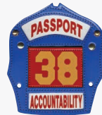
Houston Passport System