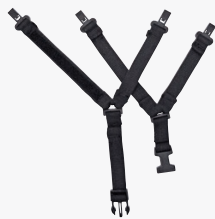
Optional Nomex® 4-point with quick-release chinstrap