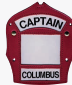
Columbus or Chicago

We can design a leather front to meet your specific needs.