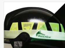
Illuminating Foxfire™ Helmet Band