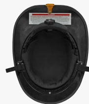
One-piece brow comfort cap