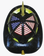
3M™ Scotchlite™ truck-style flag