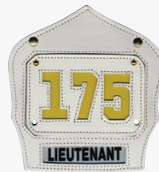
FDNY Covering Officer