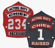
Acting Batt Chief (recessed or raised)