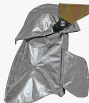
Optional J-Fire shroud

Models HT-BF2-PROX and HT-LF2 PROX also available. Both models have Crosstech® moisture barrier.