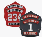
Acting Batt Chief (recessed or raised)