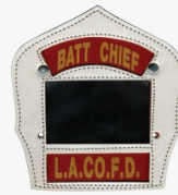
LA County Passport System