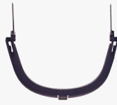
visor bracket required