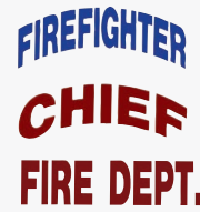
3M™ Scotchlite™ truck-style arched and straight title tapes