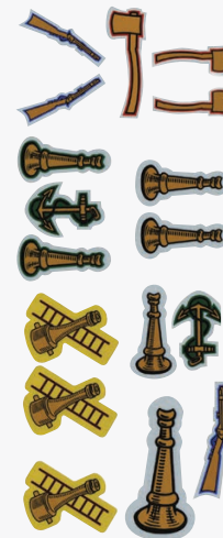
FDNY heraldic reflective insignias