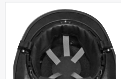
Low Rider optional leather headband and ratchet cover