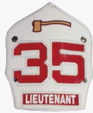
FDNY Assigned Officer