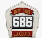
LA County Passport System