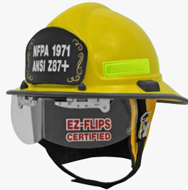
Optional EZ-Flips™ Meets standards of both NFPA 1971 and ANSI Z87.1