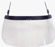
6" x .060" poly /carb visor for front and full-brim helmets