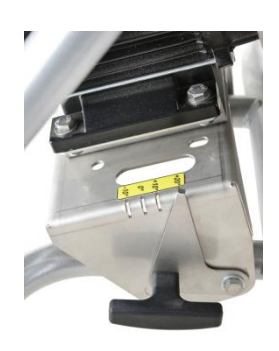
Lever to adjust the tilt angle