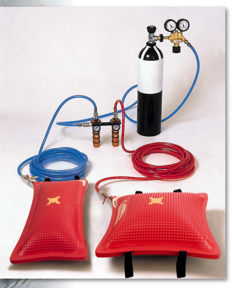
Pneumatical cushions; high-pressure - 8 bar with Kevlar®-reinforcement