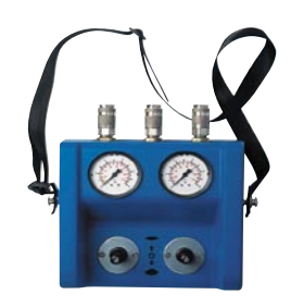
Dual control element in GRPhousing with control by joystick (dead man's control)

Single control element and dual control element (compact design, dead man's control)