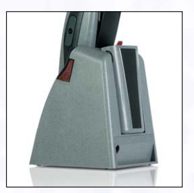
Charger with additional charging slot for second battery

www.funkwerk-sc.com info@funkwerk-sc.com