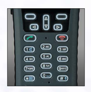
Robust, shock-resistant housing, illuminated keypad with good differentiation for use when wearing gloves