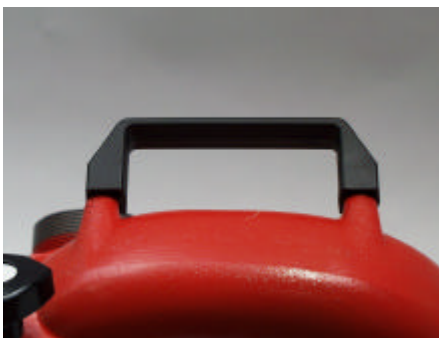
The handle makes it easy to carry Balder