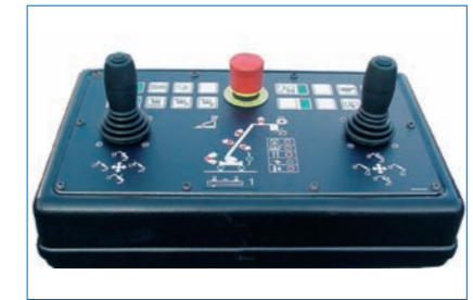
Control center can be attached to rescue platform, turntable or outrigger control center or used as a portable unit.