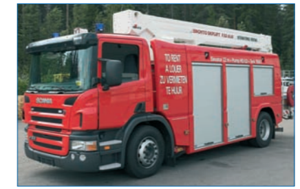
ALLROUNDER® units are designed to fit onto all commercial chassis with 2 or 4 door cab.