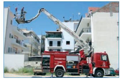
ALLROUNDER® has compact overall dimensions.