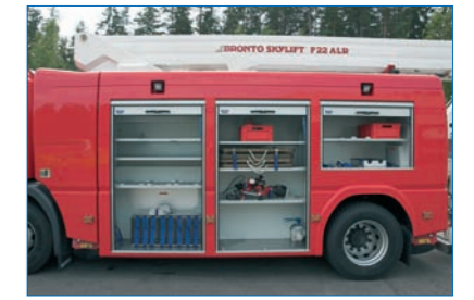
Fully customized bodywork designs available from your local partner.